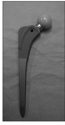
Figure 2: Photograph showing the Bicontact hip stem with ceramic femoral head. The Bicontact femoral component is a straight, tapered, rectangular, collarless titanium alloy stem, the proximal one-third of which is coated with Plasmapore with a plasma-spray technique

Clinical assessment using the Harris hip score (HHS) was performed preoperatively and postoperatively.<sup>23</sup> Three experienced surgeons had evaluated the patients postoperatively at the out-patient department. By the principle of our medical center, all patients had been evaluated and recorded with regard to the thigh pain, which was defined as pain in the anterior or lateral thigh below the inguinal area.24 If indicated, the spinal evaluation had been conducted to rule out the pain of spinal origin. For implant survivorship analysis, the criterion for failure was revision or impending revision of the femoral component for aseptic loosening. Intraoperative and postoperative complications were identified by review of medical records and radiographs.