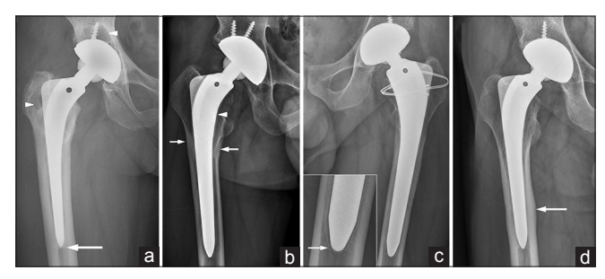
Figure 3: (a) Periprosthetic osteolysis at Gruen zone 1 and acetabular area (arrow head) and pedestal (arrow) were observed on Anteroposterior radiographs of hip of Dorr A group 8 years after primary total hip arthroplasty. (b) Endosteal new bone formation (spot-weld, arrow) was observed at metadiaphyseal junction of Dorr C femur with radiolucent line <2mm in thickness at Gruen zone 7 (arrow head), 11.4 years after primary total hip arthroplasty. (c) Radiolucent line <2mm in thickness (arrow) was observed at Gruen zone 4 of Dorr C femur 16.4 years after primary total hip arthroplasty (left bottom: magnified radiograph of Gruen zone 4). (d) Cortical hypertrophy (arrow) was observed at Gruen zone 5 of Dorr B femur 13.7 years after primary total hip arthroplasty

Statistical analysis was performed using SPSS version 19.0 (IBM Corp., Armonk, NY, USA.). Chi-square test, Fisher's exact test, or the linear-by-linear test were performed to compare nominal variables among three groups. One-way analysis of variance test was used to compare continuous variables across three groups. Bonferroni method was used as post hoc analysis. To determine the significance of trend relationship of stress shielding across the Dorr groups, we used the Kendall's tau-c test. A value of P < 0.05 was considered statistically significant.