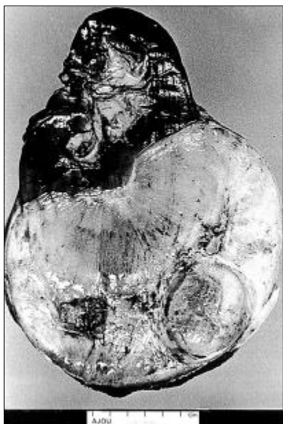
Fig. 2. The sectioned specimen revealed a 17 \times 13 cm sized, yellowish white, rubbery mass with multifocal necrosis in the lower pole of the kidney.

evidence of recurrence for 1 year after nephrectomy.