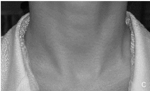
A) 6cm B) 4cm C) 가 .