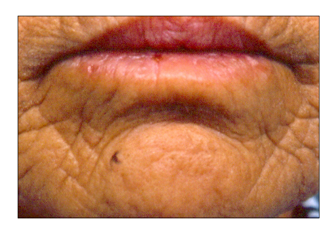
Fig. 1. A 60-year-old female with a 10-year history of pruritus on the chin.

A 60-year-old female presented with a 10-year history of pruritus on the chin. She did not have a family history of PXE. Her past medical history was unremarkable. The physical examination revealed no skin lesions, but she complained of a severe itching sensation on the chin of more than 10 years duration (Fig. 1). A punch biopsy specimen