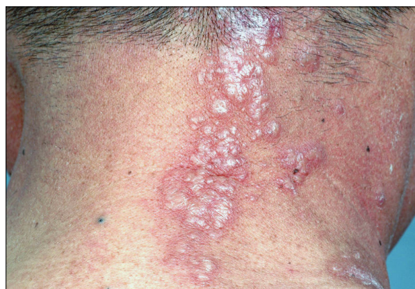
Fig. 1. Pearly, erythematous, confluent papules and plaques on the site of a previous herpes zoster. Note the dermatomal distribution (C2-3 areas) of the eruption.

postherpetic neuralgia following complete healing of the herpes zoster, but he had no tenderness on the eruption itself. The patient also had a history of malignant melanoma of the paranasal sinus with cervical lymph node metastasis and had undergone endoscopic sinus surgery with bilateral radical neck dissection 18 months before. Laboratory tests including complete blood count, chemical battery and urine analysis were within normal limits. A 3-mm punch biopsy was obtained from a papule near the border of the lesion. The biopsy specimen showed granulomatous inflammation with many multinucleated giant cells engulfing elastotic material