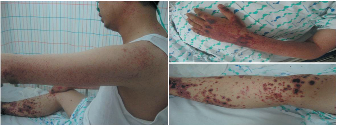
Fig. 1. Palpable purpura and ulcerations developed on the upper and lower extremities of a patient undergoing rifampin and pyrazinamide therapy.